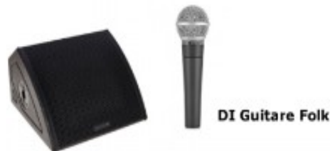
DI Guitare Folk