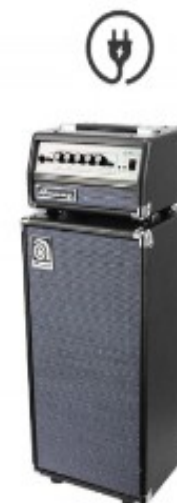
Ampeg Micro CL Audix D6 DI