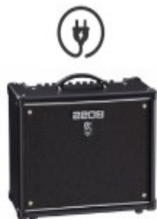
Boss Katana I E 609