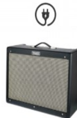
Fender Hot rod Electro 3 E 609